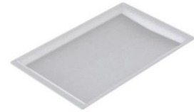
LM 28 Drip tray

1. Put the drip tray holder between the last wire space of the shelf by pushing the back part of the holder on a slant towards the cross wire.