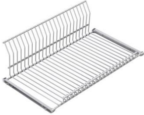
LM 93 Drying/plate rack