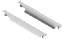
LM 29 Drip tray holder